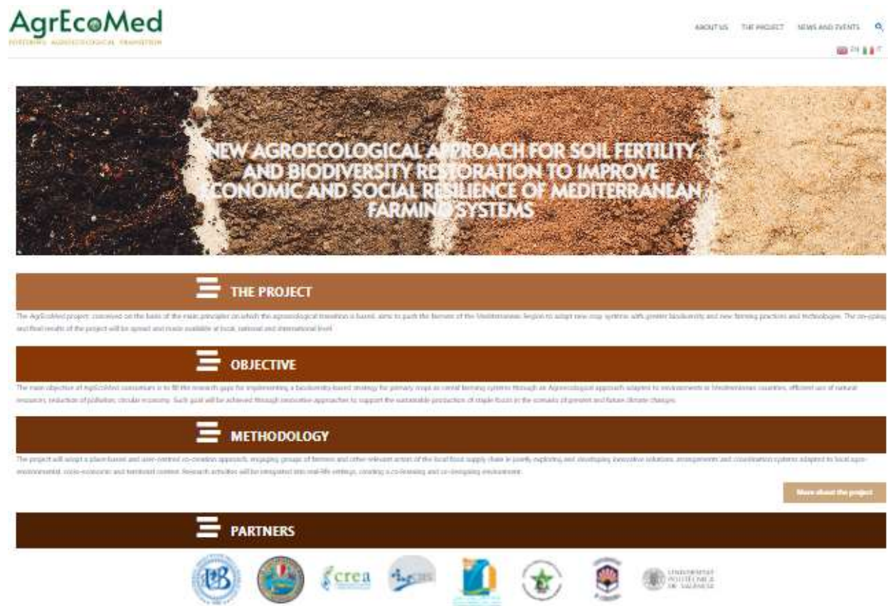
Figure 2. AgrEcoMed website Home Page and its subentries.

The website can be viewed from any device as it was developed with a responsive layout. A screenshot of the current version of the AgrEcoMed website is shown in Figure 2. The website was developed and made public by September 2022. The following screenshots were selected to illustrate the website development status as of November 2022. The website needs to be updated at least 12 times per year. The consortium as a whole is responsible for these updates. The website will be updated regularly based on the communication and dissemination plan driven by WP6. At the time of this first release the website is available in English and Italian.